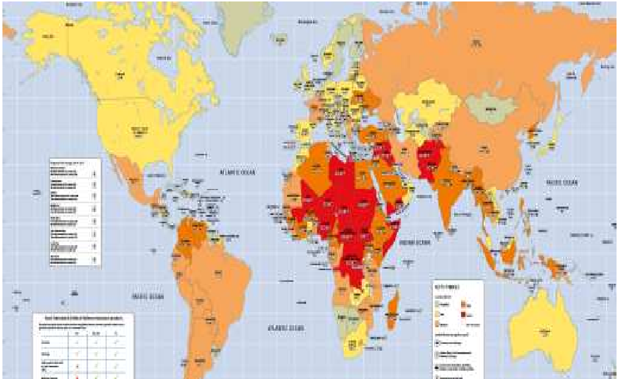
Figure 3: World map of terrorism in 2015